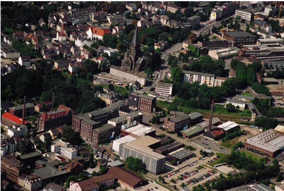
ZWILLING J.A. HENCKELS from a bird's view.