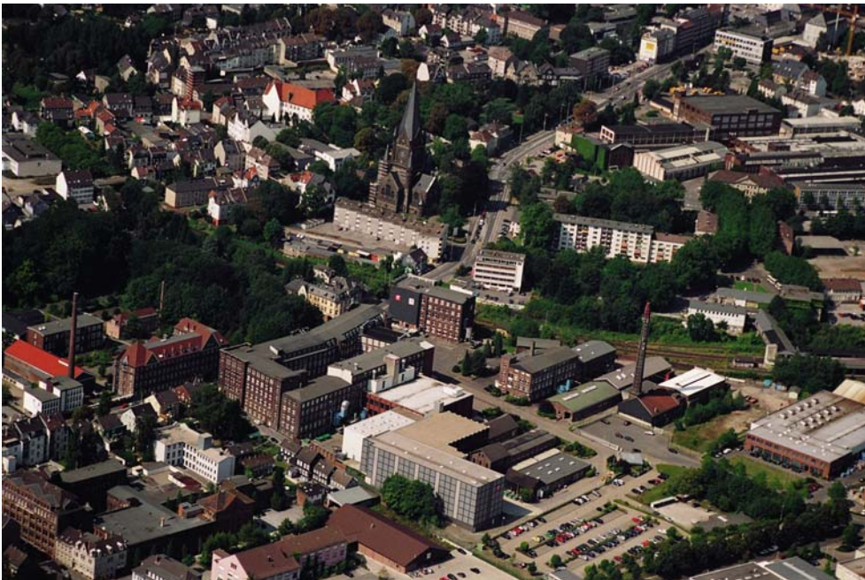
ZWILLING J.A. HENCKELS from a bird's view.